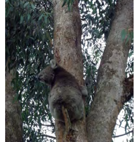
After returning to Kurth Kiln we saw a Koala sitting on a tree branch opposite the Kiln site.